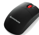
Lenovo Laser Wireless Mouse