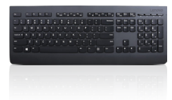
Lenovo Professional Wireless Keyboard