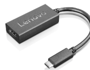
USB-C to HDMI Adapter